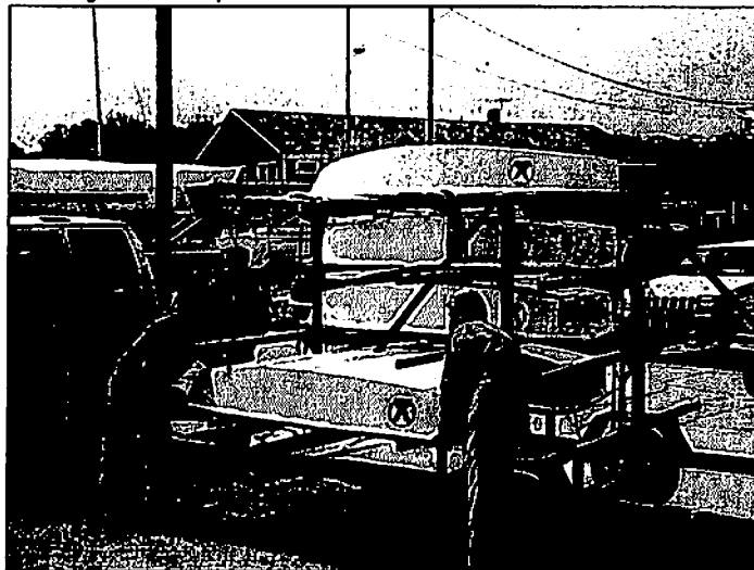
unloading brand new optimists at DBMS